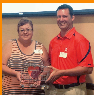
SuperValu was presented with the 2015 Food Donor of the Year award.

Thanks to SuperValu, County Market and Illini Fighting Hunger for their continued support. Each is a true example for other groups in our community. Congratulations to each of our award winners! Their commitment to the issue of food insecurity personifies the Eastern Illinois Foodbank's mission of alleviating hunger and nourishing stronger communities.