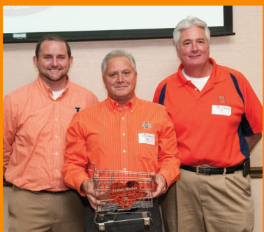
2015 Business Partner of the Year is County Market

Additionally, SuperValu more than doubled their food donation from a year ago. They also significantly impacted the donations of others to the tune of thirty eight thousand pounds. In all, SuperValu donated roughly a quarter of a million pounds of food to Eastern Illinois Foodbank in fiscal year 2015. Through their efforts, SuperValu was able to provide enough food for 195,000 meals to families in our community last year alone.