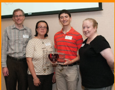
Illini Fighting Hunger was honored as the 2015 Community Partner of the Year.

The success of the campaign is a true testament to County Market's strong leadership, dedicated staff and loyal customers. Day of Giving 2014 wouldn't have been as successful without the support of County Market. Day of Giving is so much more than a simple food drive. It's a day of generosity. A day of hope. A day that changes lives for many right here in our community.